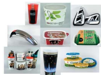
2009 IMDA Awards Winners

Complete entry details, rules and entry form are available at http://www.imdassociation.com/inmoldda/2010+imda+awards+competition/default.asp .